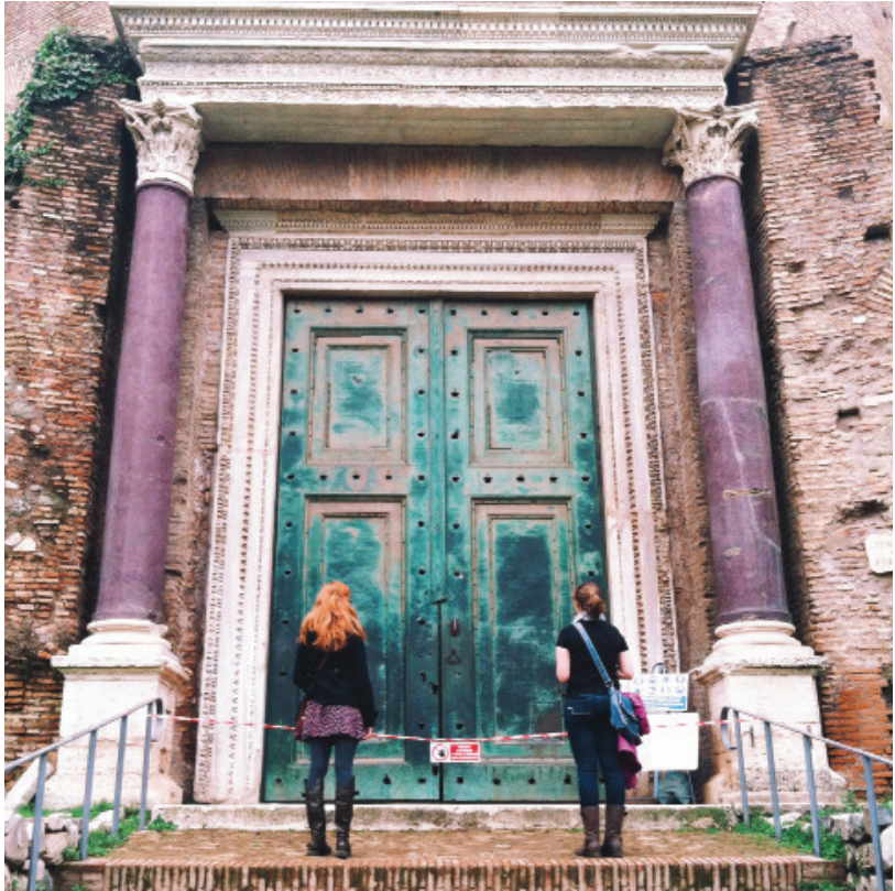
Emily Luse, "A Crumbling History" Digital, iPhone 4