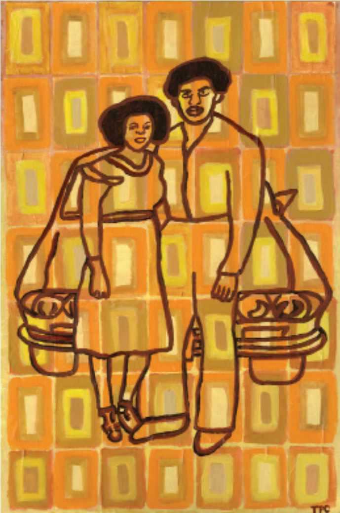
Tracy Poindexter-Canton, "Parental Throwback" Acrylic on canvas and Post-It Notes, 2' x 3'