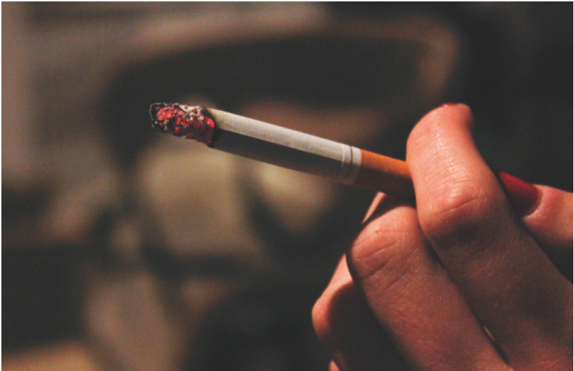
Katherine Sumantri, "Good girl, bad habits" Digital, Canon EOS 550D