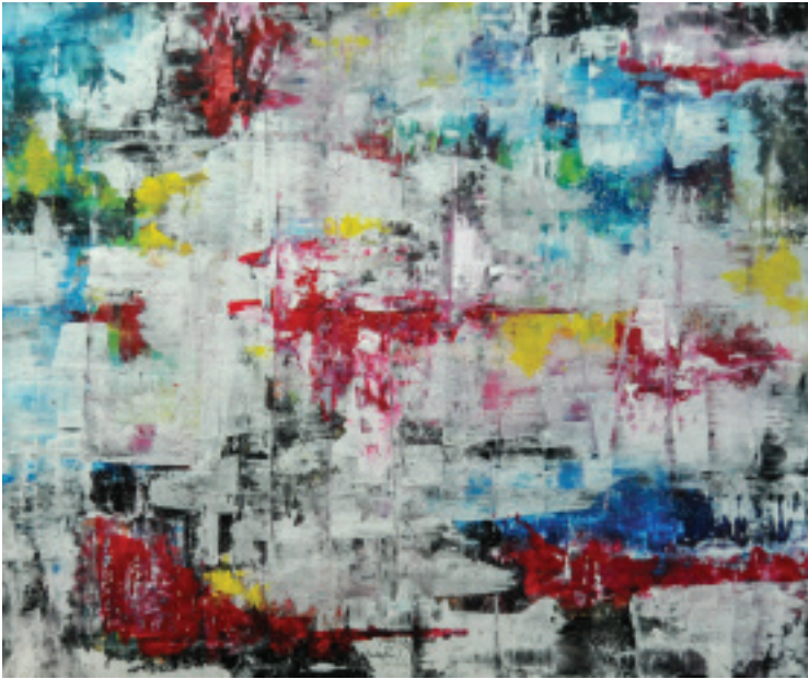
Andrew Fioretto, "Color my Idiosyncrasy" Acrylics on Canvas, 2' x 2.5'