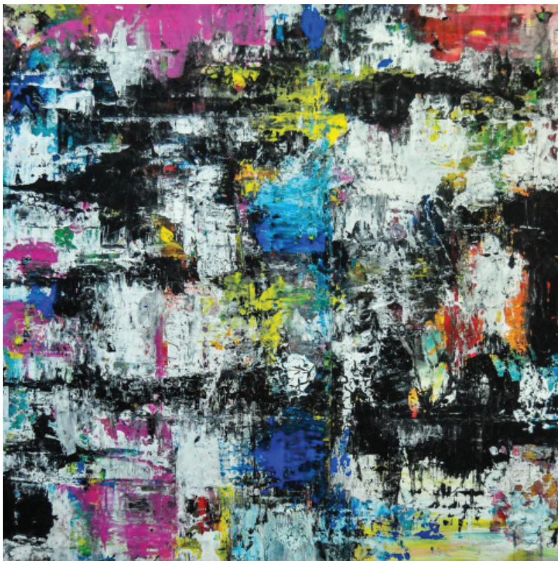
Andrew Fioretto, "Punk Phonics" Acrylic, 2' x 2'