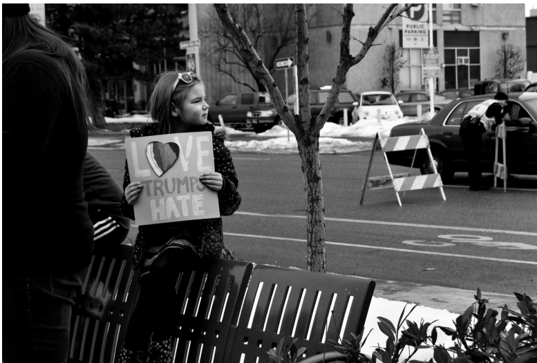
SPOKANE WOMEN'S MARCH