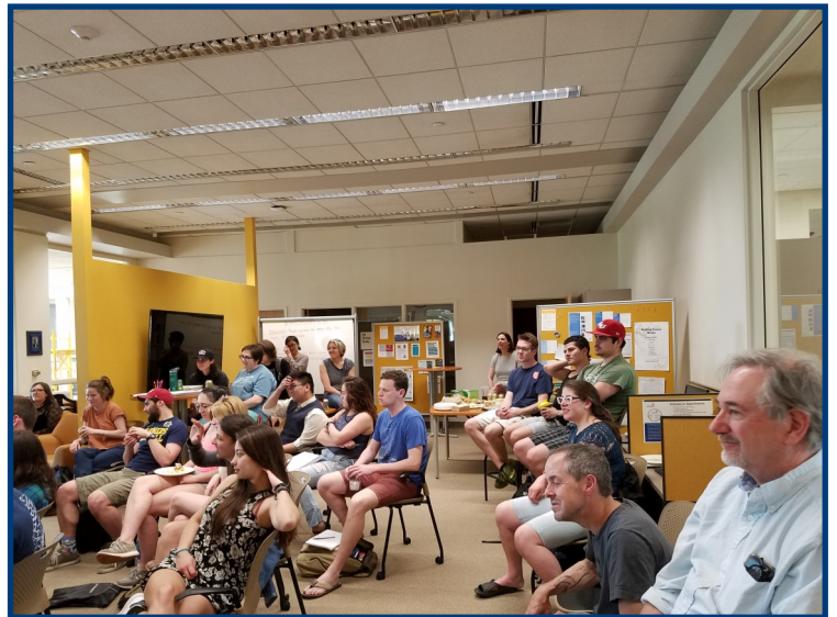
Captivated listeners in the GU Writing Center, listening to guest writer Hanif Abdurraqib

The close attention to language seems to me as important an endeavor as any we can undertake. It borders on cliché to say humans are the language (or story) making animals, but it is an evolutionary “miracle.” Taken further: we are, as individuals, as subjects, constituted by language: it is in a large system of a given language that we identify our own idea of who we are, what we feel, of what is right and what is wrong. And through that language (already socially given), we are able to negotiate and renegotiate all of those notions. The great 20th century philosopher Ludwig Wittgenstein leaves us a pair of famous axioms that have moved and influenced me throughout my adult life: first, “The limits of my language mean the limits of my world”; and second, “what we cannot speak of we must pass over in silence.”