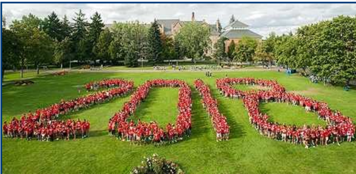
The Gonzaga Class of 2018 united on The Quad

Stories and books are mirrors into the soul of a culture. We would not be whole without them, as Milton knew: For books are not absolutely dead things, but do contain a potency of life in them...they do preserve as in a vial the purest efficacy and extraction of that living intellect that bred them. But language is more than written words—it is any way we communicate and it is what inspires passion, discussion, thought, and action in our society. Virginia Woolf, Lin-Manuel Miranda, Maya Angelou, and Elie Wiesel all changed the world, and they only used their words to do it.