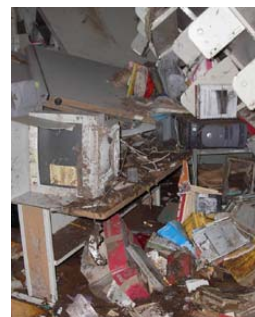
Foley is trying to plan ahead before a disaster happens like this one at the U of Hawaii