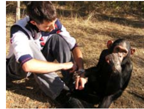
Student and Hans

(3 credits) 300-level psychology course. Observe chimps in what is as close to their natural environment as possible. Learn field and observational research skills; participate in guided observations and create a mini research project.