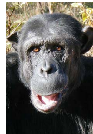
Pal - first chimpanzee at Chimfunshi

Chimfunshi Wildlife Orphanage is located in the northern “Copperbelt” region of Zambia. Chimfunshi is 24,000 acres of remote African bush forest. The sanctuary is home to over 120 chimpanzees, a hippo, numerous monkeys, birds and approximately 300 Zambian residents. The center has “deluxe camping facilities:” solar power, sleeping cots, shower rooms (cold), pit toilets with shelters, a cooking